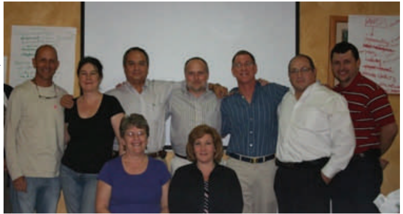
Steering Group of ANID, at the Seminole Hotel

Some of the issues discussed during this retreat were how to increase our membership, gain strength and recognition, defining member benefits, how to communicate in a better manner, how to establish closer relationships with government officials, a strategic model to move forward, what to expect from ANID and how to be better heard by the public, investors and government.